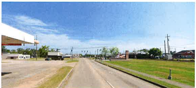
View from SW Railroad Ave.