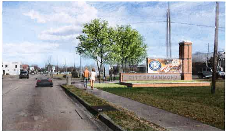
View from SW Railroad Ave.