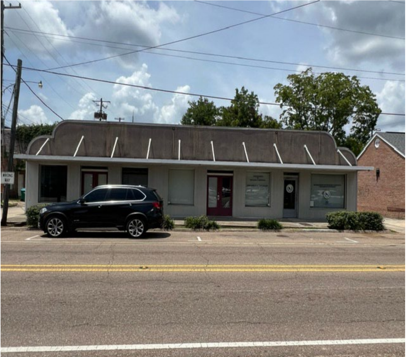
107 N. Cherry St.